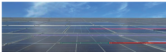
Figure 1: Project Picture