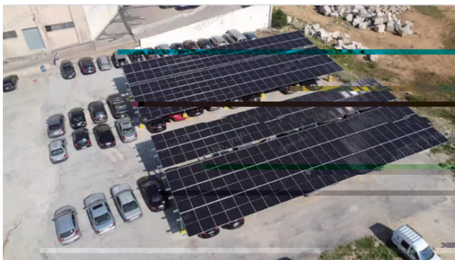
Figure 1: Project picture

All modules were equipped with high-precision sensors to monitor power generation data in real time to ensure the accuracy and credibility of the test results. During the test, a number of key data were collected at in interval of 6 minutes, including DC voltage, current, power, module temperature, front irradiance etc. These data provide detailed information, allowing us to conduct in-depth analysis and comparison of the performance of the modules.